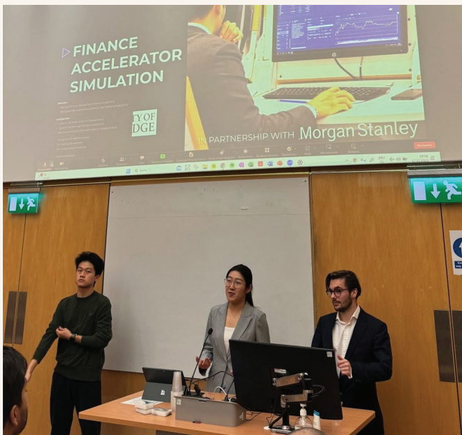
AmplifyMe Trading Simulation Event

In March, we will be hosting our flagship social event, organised by the President's Drinks Committee. Attendees will be able to meet and network with leading figures in the financial industry over drinks. Senior management from bulge bracket banks, hedge funds, and private equity firms as well as alumni will be our guests.