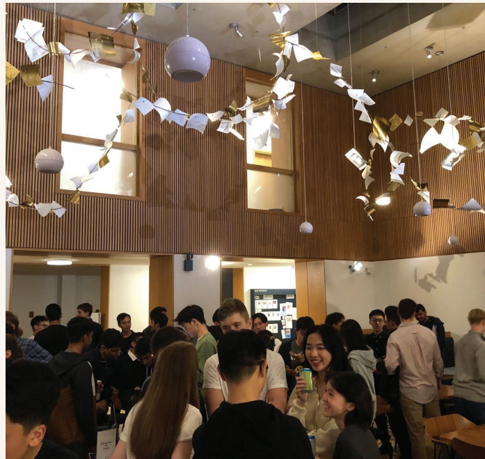
CamSIF Social at Newnham College Bar